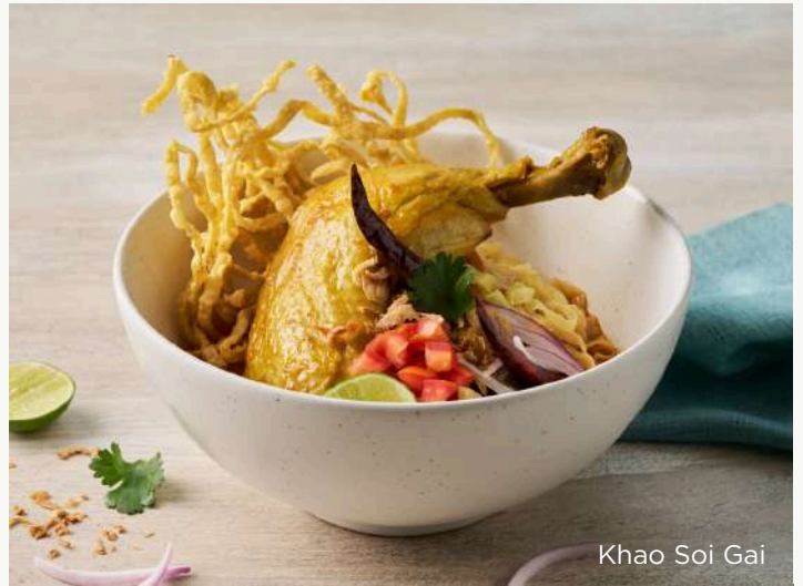
Khao Soi Gai

riceberry, avocado, cucumber, carrot, coriander, edamame, sweet potato, sesame, soy ginger dressing