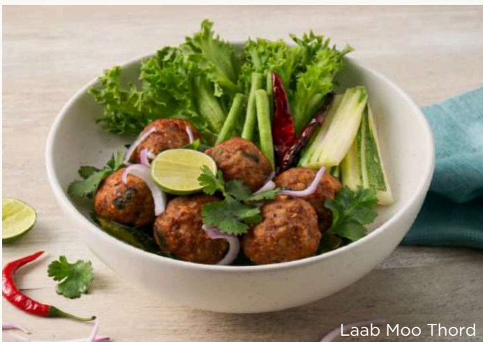
Laab Moo Thord