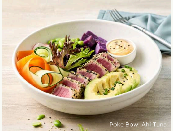
Poke Bowl Ahi Tuna