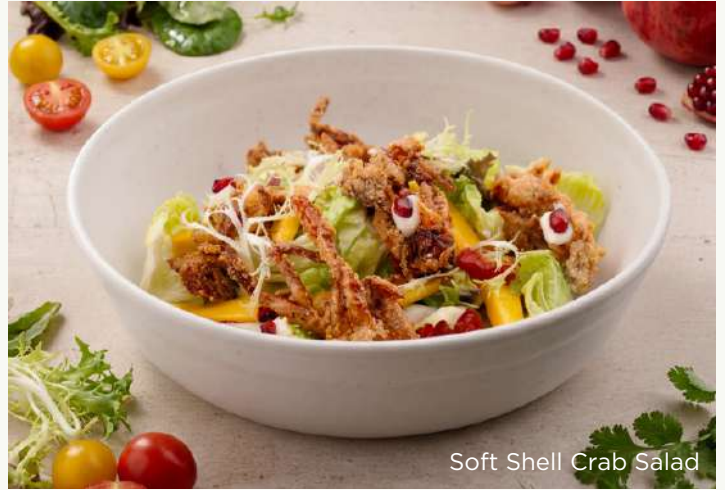
Soft Shell Crab Salad

Japanese cucumber, onion, green olives, vine tomatoes, feta, mint, parsley, sourdough toast