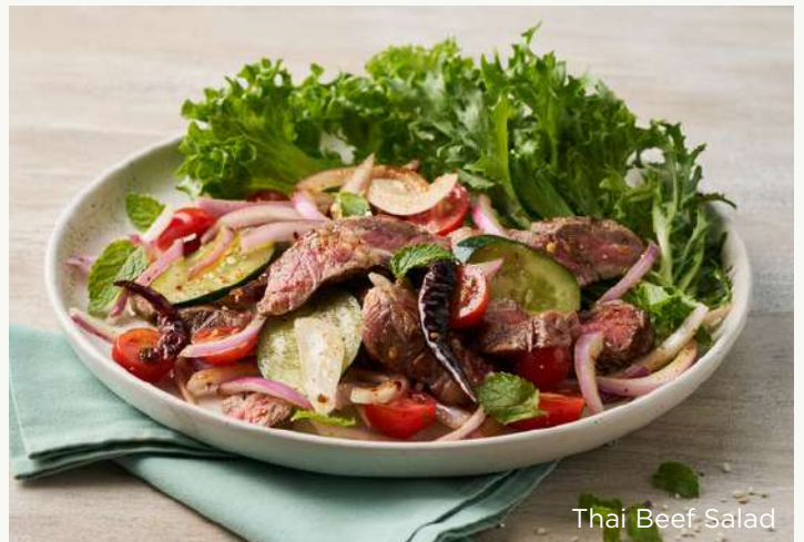
Thai Beef Salad