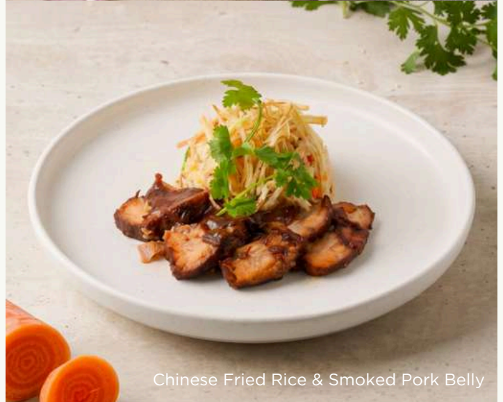
Chinese Fried Rice & Smoked Pork Belly