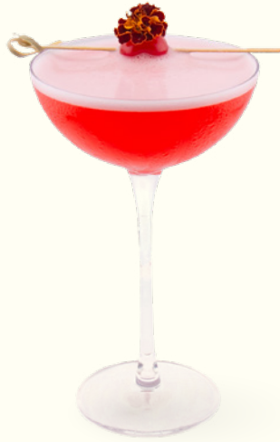
PINK LADY 300