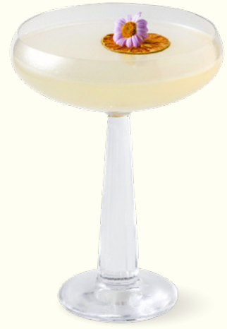
LIME DAIQUIRI 300