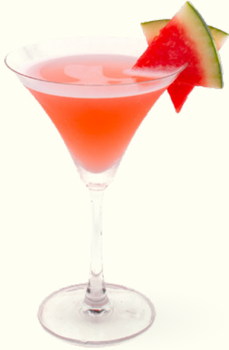
WATERMELON MARTINI 300