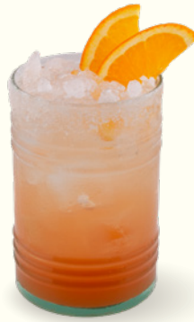
PALOMA COCKTAIL 300