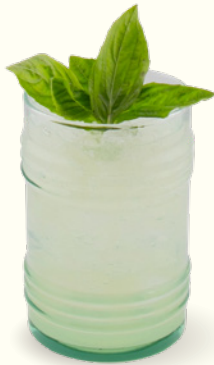
GIN BASIL SMASH 300